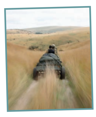
56. Day safari and lunch at Port Lympne Reserve, nr Hythe, Kent